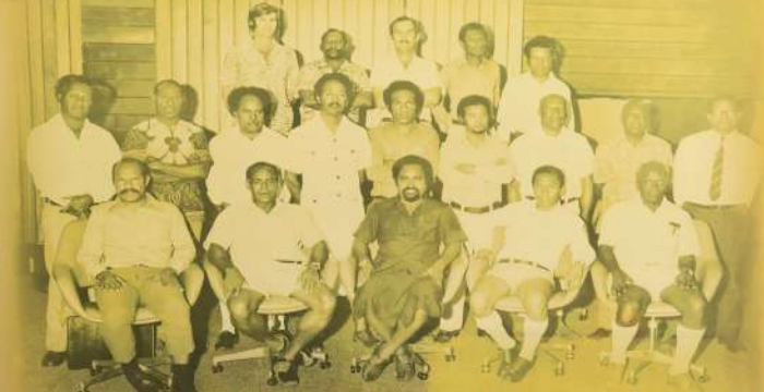
MEMBERS OF THE NATIONAL EXECUTIVE COMMITTEE AS FROM 24TH SEPTEMBER 1978