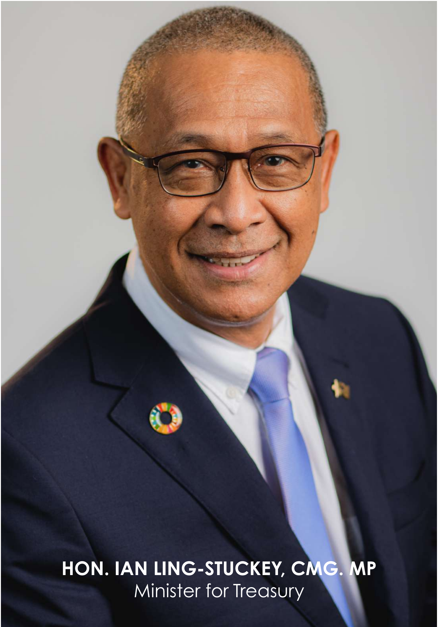
HON. IAN LING-STUCKEY, CMG. MP Minister for Treasury