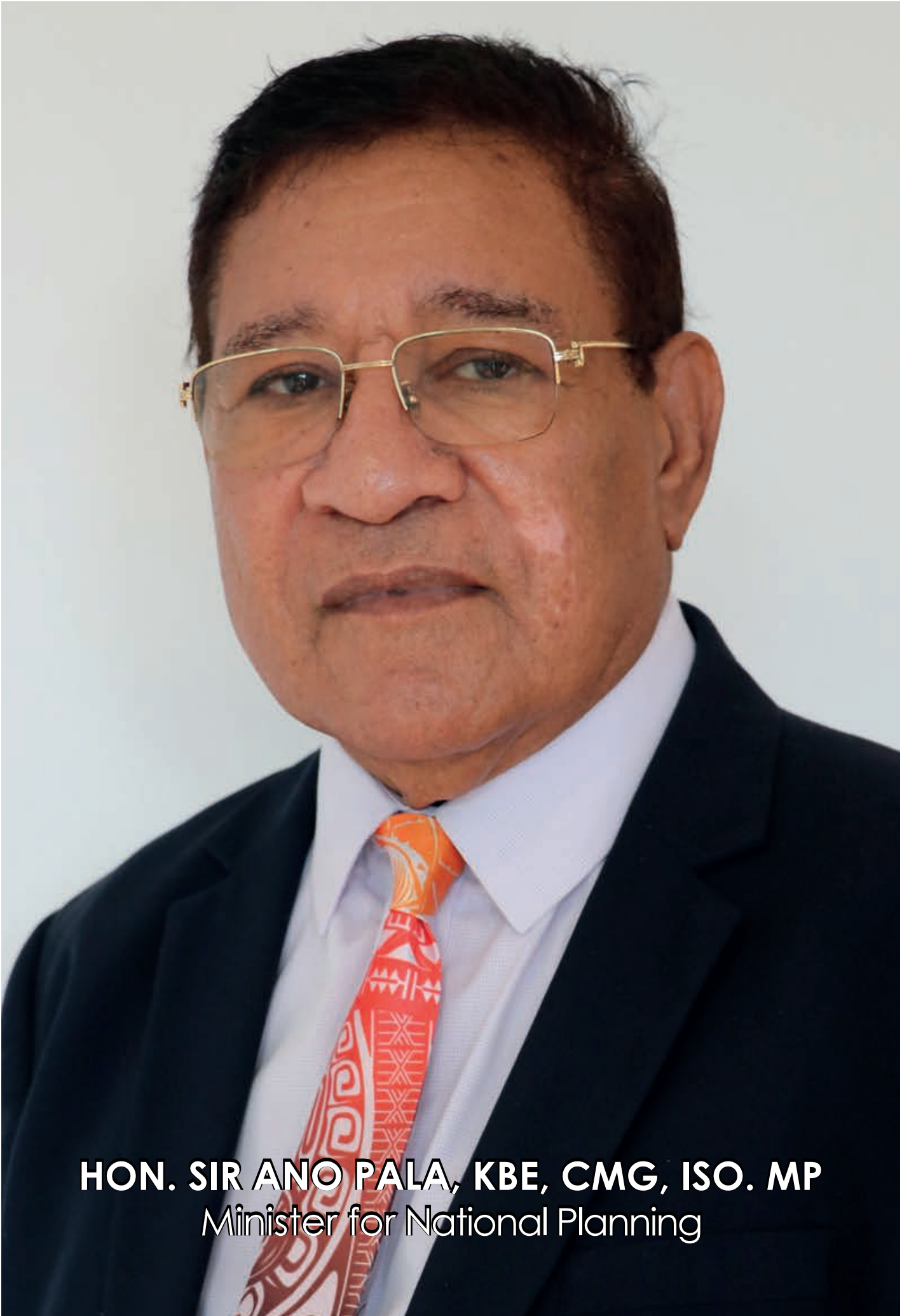
HON. SIR ANO PALA, KBE, CMG, ISO. MP Minister for National Planning