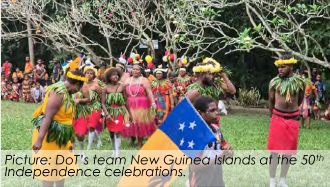
Picture: DoT's team New Guinea Islands at the 50 th Independence celebrations.

Kokopo beachfront is loaded with your bags and you take your phone out to take pictures and make one last call to families, the crystal clear waters of New Britain takes you past the Duke of York Islands as you head towards the tip of New Ireland Province, then a PMV takes you through the Boluminski Highway as you head into bilas peles (Kavieng town). A peaceful and beautiful town with very friendly people. Spend some time there and off