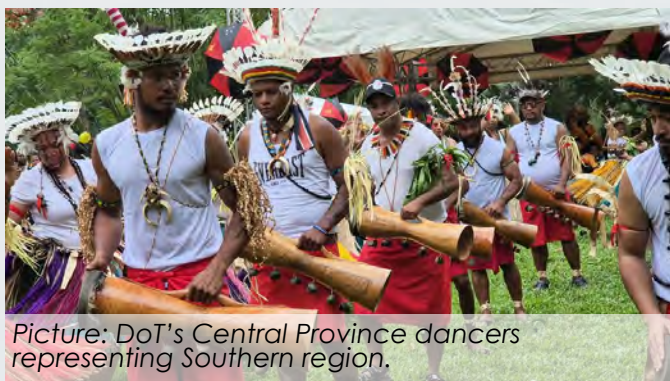
Picture: DoT's Central Province dancers representing Southern region.

Taking a road trip along the new Port Moresby – Alotau highway, you pass through Rigo and Abau and into size 28 land, right through to the tip of your country's map or should we say Escape to Eastcape....That Wan How! The tip where oceans never meet the sky. Getting on a small boat you arrive in Dogura Plateau onto Rabaraba, past Wanigela and Tufi,