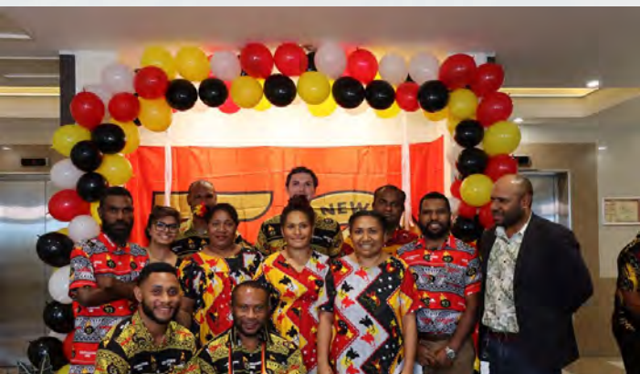
Team Macro Economics Policy Division