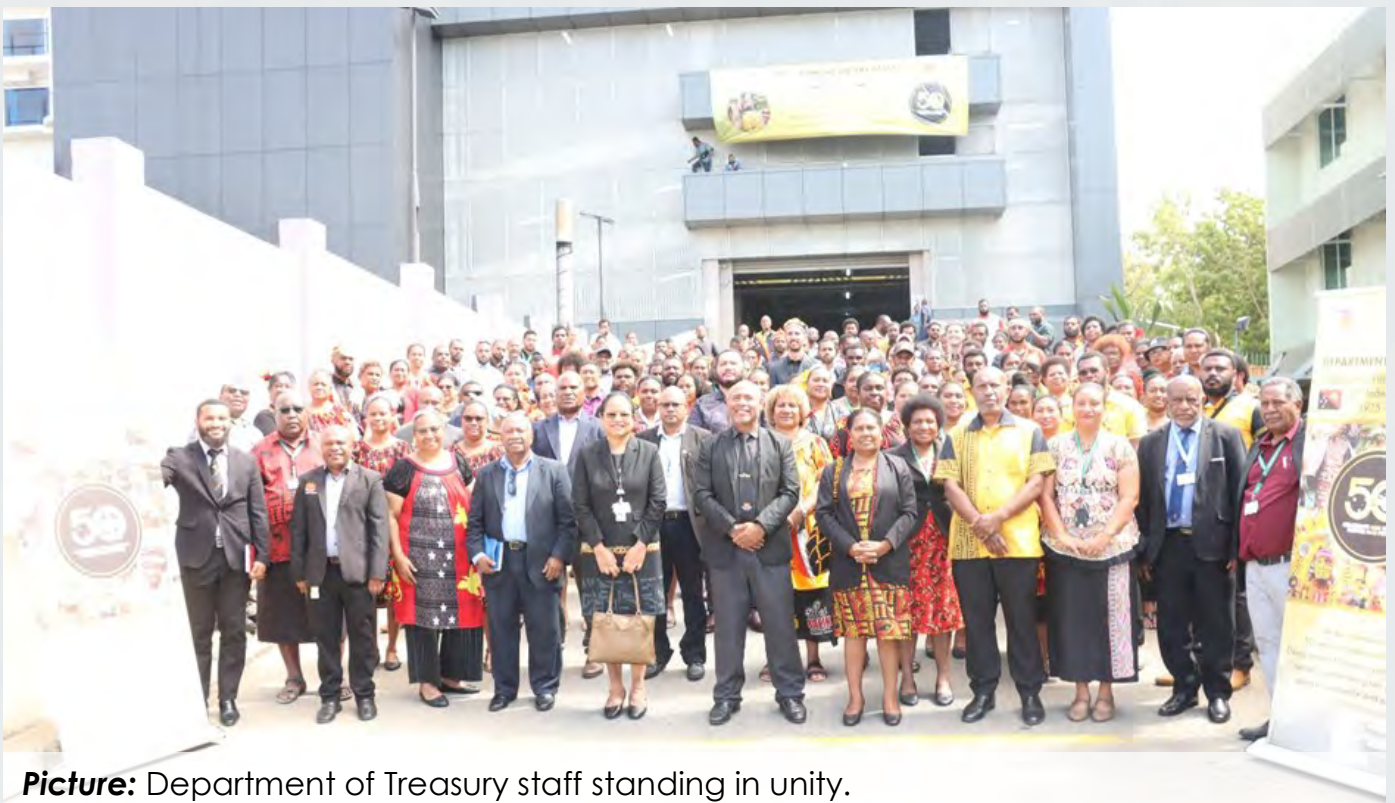
Picture: Department of Treasury staff standing in unity.