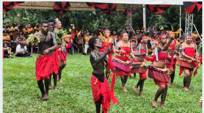
Picture: DoT's Trobriand Island dancers celebrating PNG's 50 th anniversary.

the Musa river mouth and Oro Bay awaiting you....Oro! Oro....Welcome to the land of the Golden butterfly, a rich fertile land lying innocently under the quiet foot of the sleeping Mt. Lamington, this is Oro Province. The land that become part of World War 2 which still holds the toughest Kokoda Track where tourists frequent every year.