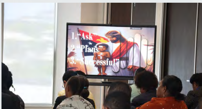
Picture: Staff of the DoT attending PNG's 50 th Anniversary thanksgiving service at the Treasury building level 5.

The service coincided with the cutting of the cake to celebrate the old and mark a new era for the Department of Treasury.