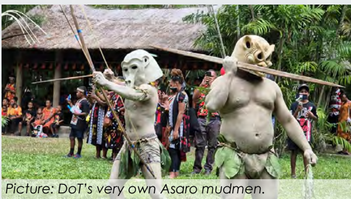
Picture: DoT's very own Asaro mudmen.

Keep on moving pass the fresh coolness of wara Simbu heading into Simbu limestone Elimbari up to the top of Daulo pass and the view from cold peles Goroka lies beneath the beauty of the Nokondi skies with an amazing view. The plains and grassland and savannah view with pine trees between Goroka and Kainantu makes you think you are in Colorado. Anyways pass by Kainantu town and looking down into the biggest hydro system in the country. The mighty Yonki power hydro system at Arona valley. A nice smooth ride takes you to the top of Kassam Pass with a scenic view of the Ramu Valley.