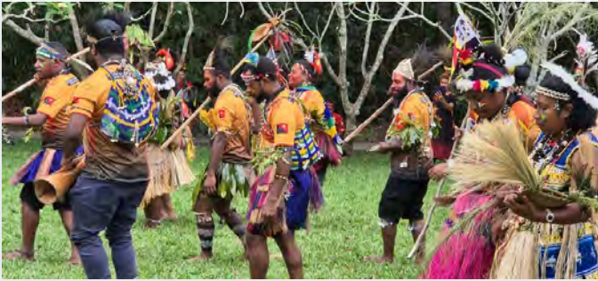
Momase staff and families