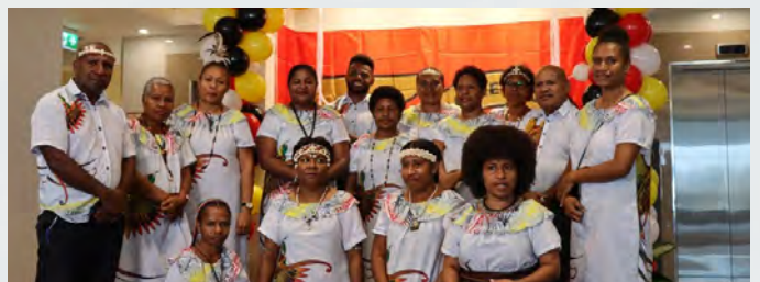
Team Corporate Services Division