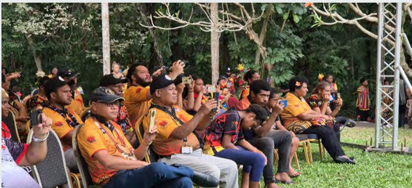
Picture: Treasury staff at the Launching of the 50 th Anniversary Commemorative Banner and lead up activities of Papua New Guinea's Golden Jubilee Independence