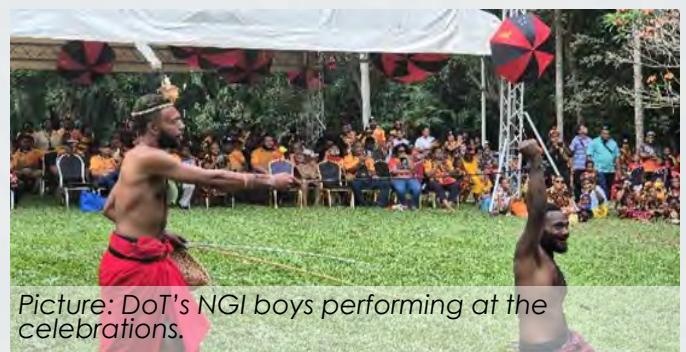
Picture: DoT's NGL boys performing at the celebrations.

the coastline and mountains of Finschhafen overshadows you across the sea to the Siassi Islands and into the coastlines of West New Britain as the Bali and Vitu islands sleep calmly across the sea and the point from Talasea guides your way into Kimbe Town known as little Papua New Guinea and commonly known people of their style of friendship which they say welcome to "pasin West". An hour's drive into Biella town and the New Britain Highway breaks through some toughest terrains and fast following rivers that takes you into the Baining land, a unique group of people who can walk on red hot mumu stones and can eat fire.....welcome to East New Britain, the home of Vulcan and Tavurvur mountain paia na guria where the famous Rabaul Gurias rugby league team got its name.