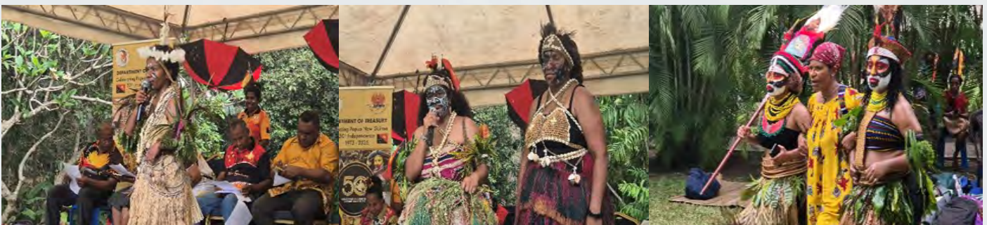
Picture: Staff participating at the DoT's PNG Traditional Attire Competition, proudly showcasing their traditional "bilas" (attire).