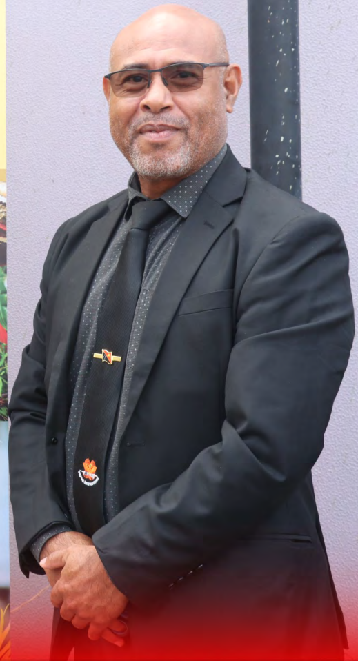
(Picture: Secretary Oaeko unveiling the Department of Treasury's 50 th Anniversary Commemorative banner)