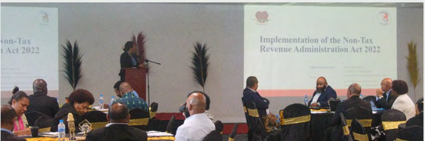
Picture: A presentation during the workshop

I wish you all a productive workshop outcome during this main workshop and one-on-one agency consultations starting tomorrow. Thank you, once again, for your presence and your cooperation.