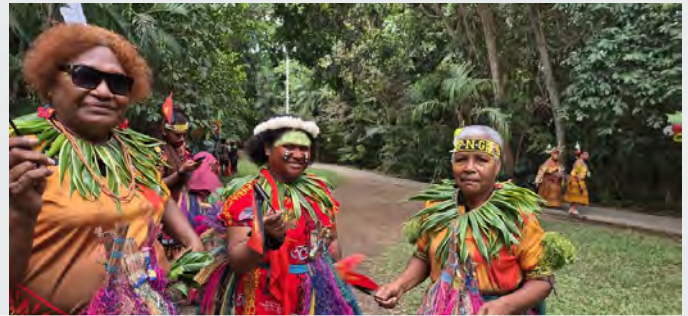
Team NGI and families