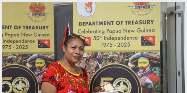
Picture Top-Bottom: Staff posing with the DoT's 50 th Anniversary Commemorative banner.