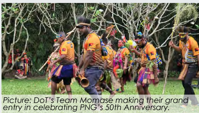
Picture: DoT's Team Momase making their grand entry in celebrating PNG's 50th Anniversary.

Away you go, getting on MV Momase, you taste the Mighty Sepik river meeting the ocean early hours of the morning, and the bright morning sunlight takes you into Wewak wharf. Ples na taun bilong Late Papa Sir Michael Thomas Somare, for his determination we are celebrating this 50 th Golden Jubilee. Thankyou tru!