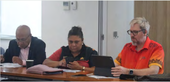
Picture: Members of Port Moresby Chamber of Commerce during the Consultation meeting.