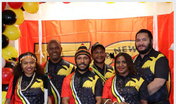
Team Sectoral Policy Division