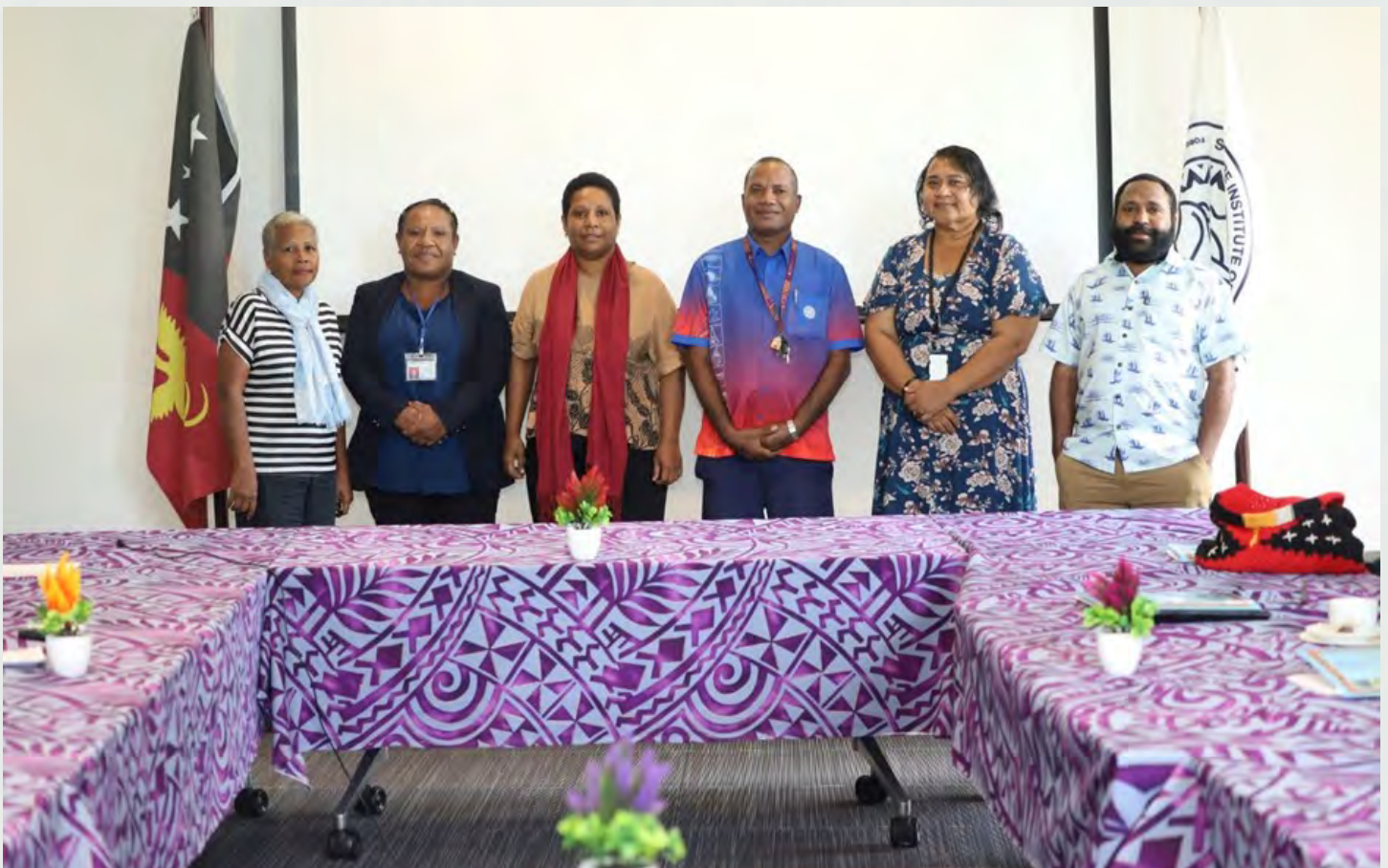
Picture: Team DoT & SILAG representatives.

The Department of Treasury will work in collaboration with SILAG in implementing its GDP 2025, as well as utilizing its services for capacity building, career and succession plans into the future.